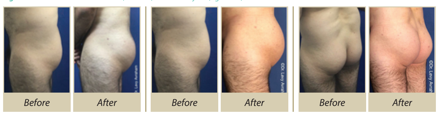
Figure 4. Before and 3 months after (Left side) and after 1 year (right side).

Apparently healthy 23 year-old male. Patient complaint on small buttocks area he wanted to enlarge. Physical examination revealed small and flat buttocks with 5cm pinch thickness and obese and full abdomen. Good skin quality without spare skin 4cm pinch. Patient underwent general anesthesia. Local anesthesia with standard tumescent solution was infiltrated in the waist and abdomen areas. Laser-assisted liposuction was applied on the waists area using energy at 15W with 600 microns, radial laser fiber where 600mL fat was removed from the waist at each side, 300mL from the chest and additional 600mL from the abdomen. 600mL of harvested fat was injected to each of the buttocks using 4mm canula using fanning technique in particular to the upper apex of the buttock for lifting and volumizing. No adverse side effects were noted. Before and after photos reveal significant improvement in the buttock size and volume.