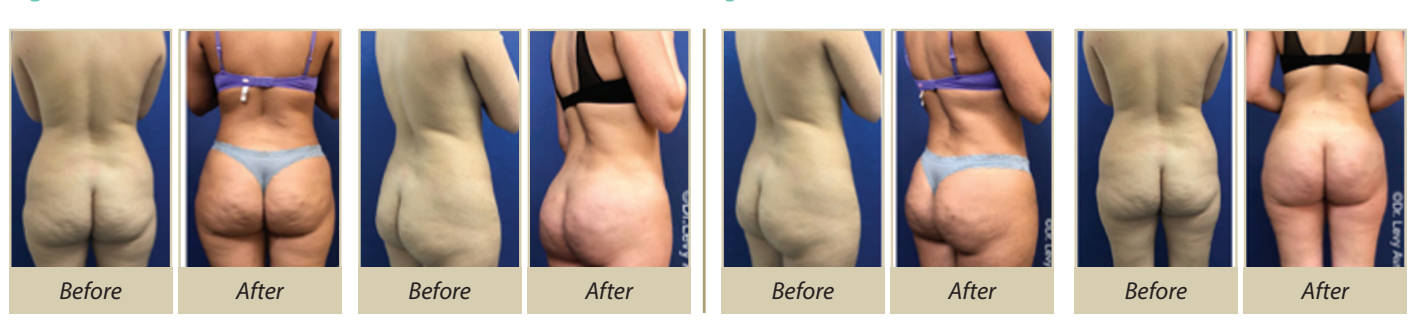
Figure 5. Before and 4 months after (left side) and 9 months after (right side).

Apparently healthy, 21 year-old woman, HIV+ carrier. Patient is treated with "cocktail" and undetectable. Patient is interested in buttock enlargement. In addition, patient complained on excessive adiposis in the waists, abdomen and the submental area. Physical examination resulted in waists fullness and pinch thickness of 4.5cm. Abdomen fulness everywhere. Good skin quality without excessive skin upon pinching (4cm). Moderate cellulite in the posterior thighs & buttocks. Patient underwent general anesthesia. Local anesthesia with standard tumescent solution was infiltrated in the waist and abdomen areas. Laser-assisted liposuction was applied on the waists area using energy at 15W with 600 micron, radial laser fiber where 600mL fat was removed from the waist at each side, 50mL from the submental area and additional 200mL from the abdomen. 600mL of harvested fat was injected to each of the buttocks using 4mm canula using fanning technique in particular to the upper apex of the buttock for lifting and volumizing. No adverse side effects were noted. Before and after photos reveal significant improvement in the buttock size and volume.